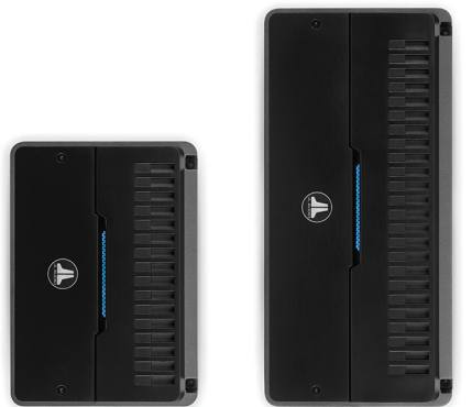
RD500/1 500W, monoblock subwoofer amplifier