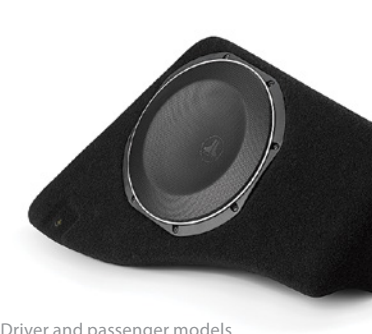
available (sold separately)